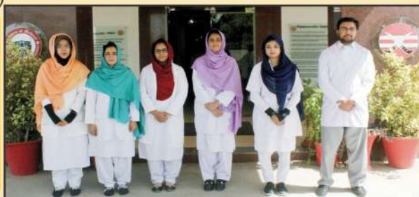
QIMS STUDENTS DRESSED IN COLLEGE UNIFORM